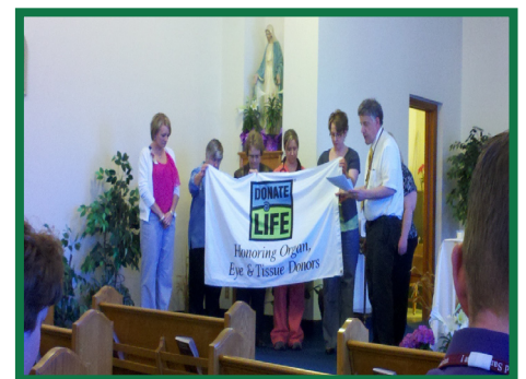
Above: Donate Life Flag is blessed by the Donor Awareness Council in Kearney, NE during their donor remembrance ceremony.

Toward the end of April, NORS staff raised awareness by attending an Omaha Storm Chasers game and handing out Donate Life hand