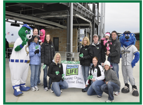
Above: NORS Staff at an Omaha Storm Chasers game

Looking back, Donate Life Month was a huge success and raised awareness at both the state and nationwide level. NORS would like to thank its hospital partners as well as its community and individual partners for their continued support of our mission. To learn more about how you can get involved visit www.nedonation.org .