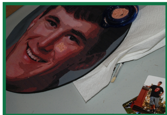
Above: floragraph of Moose that will be displayed on the 2010 Doante Life Float